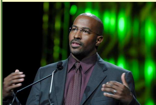
Van Jones delivers the Ware Lecture on Environmental Justice at the 2008 UUA General Assembly in Fort Lauderdale, FL

issues, and also a desire to work for economic, race, gender, and class justice. As we discuss food issues, how can we bring our social concerns together?